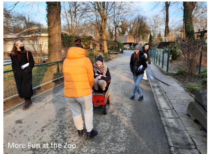
More Fun at the Zoo