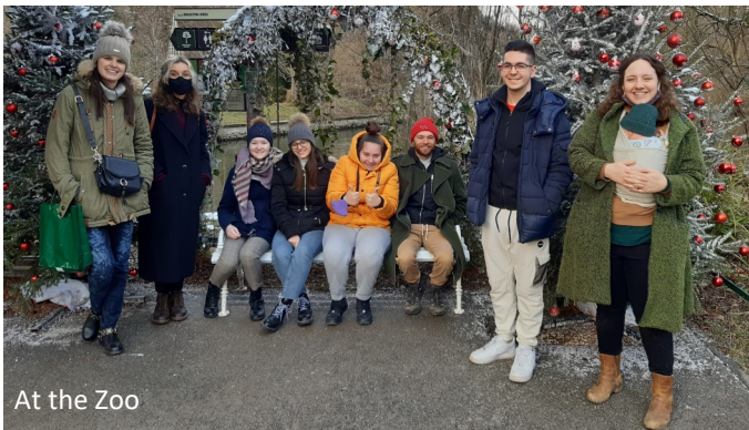
At the Zoo

At the beginning of this month, we went to the Zoo with a few teens. Outside is the only place we can currently gather. We were all admiring God's creation there and enjoying being together. Our teens had a really great time together!